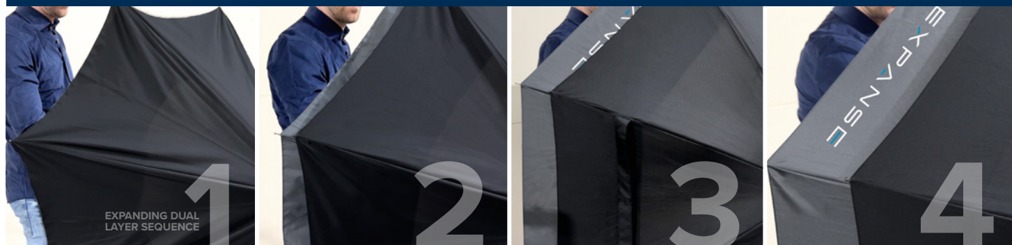
BLACK/GREY - OPEN

Introducing the Expanse, our innovative umbrella with expanding dual layer for increased coverage and comfort. Featuring a durable frame, auto open button, SPF 30 rating for sun protection, and a convenient velcro closure band.